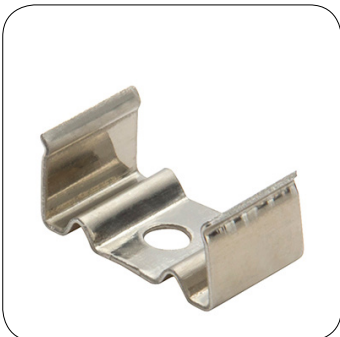
FP03 mounting clip