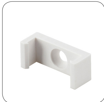
FP03 mounting clip