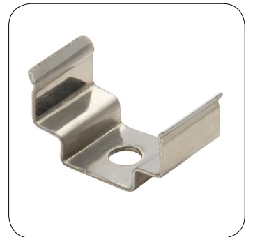
FP03 mounting clip