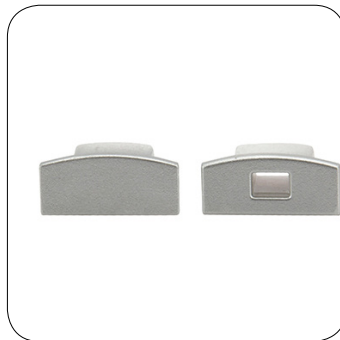
AP0101 end cap